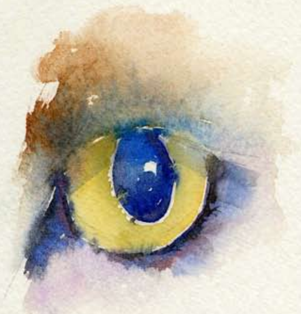
Eye using ALL THREE Techniques.

Colour pulled from one wet area, over a dry patch to another wet area, or just out onto dry paper,