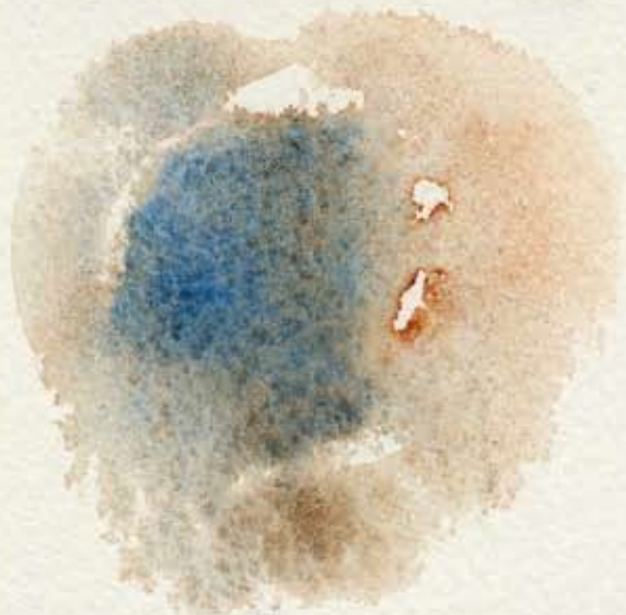
LOST & FOUND EDGES