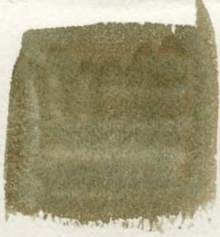
CARULGAN BLUE +